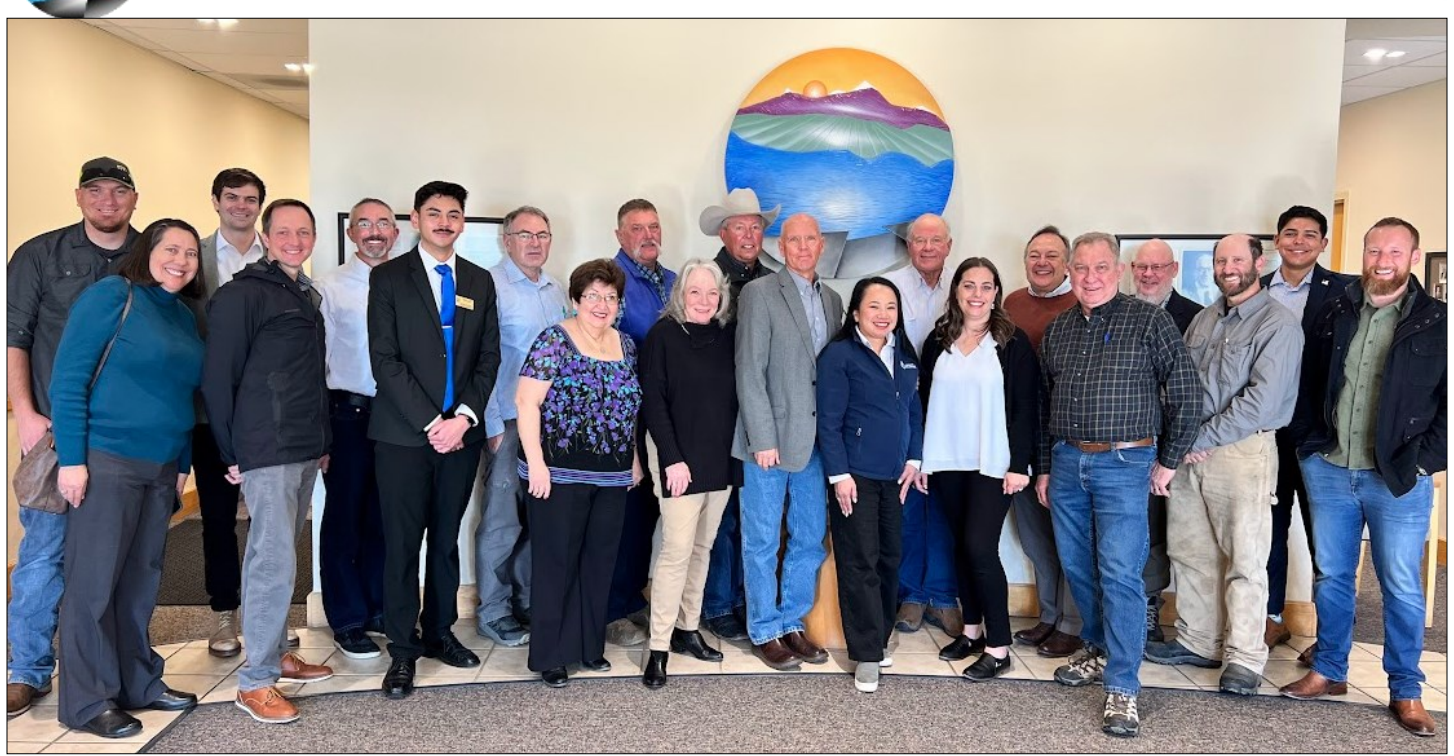
Reclamation, Southeastern District and congressional staffers are all smiles after the announcement of $250 million for the Arkansas Valley Conduit at Southeastern headquarters on January 8, 2025.